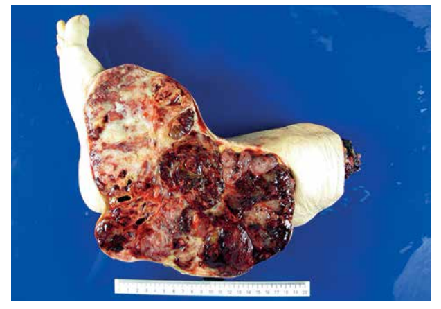
Supplementary Fig. 4. Gross finding of surgical specimen for the right ankle joint tumor