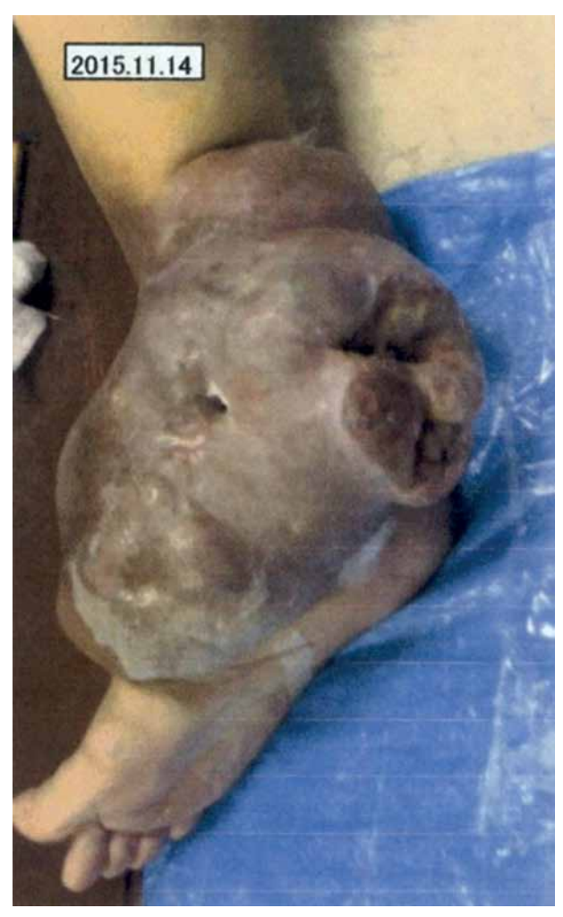
Supplementary Fig. 2. Photograph of the right ankle joint tumor from 2015 showing the tumor accompanied with necrosis and infection