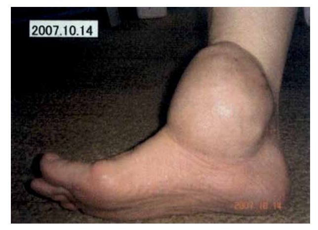
Supplementary Fig. 1. Photograph of the right ankle joint tumor from 2007